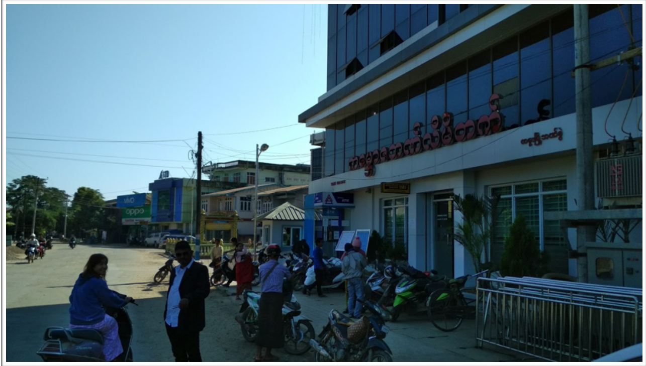
Picture Set 2: Tamu, Sagaing Region, Myanmar Photographed by the author during a visit on 8 November 2017