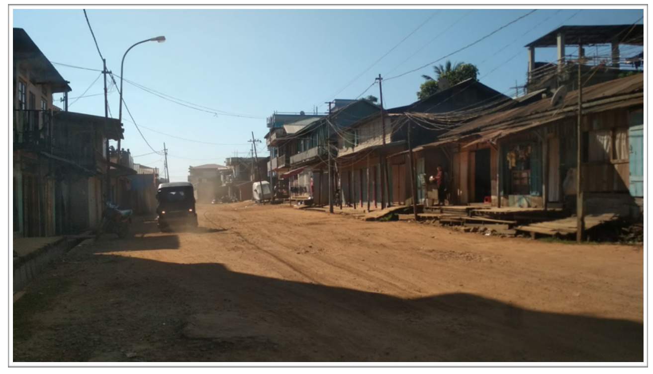
Picture Set 3: Moreh, Manipur, India Photographed by the author during a visit on 8 November 2017