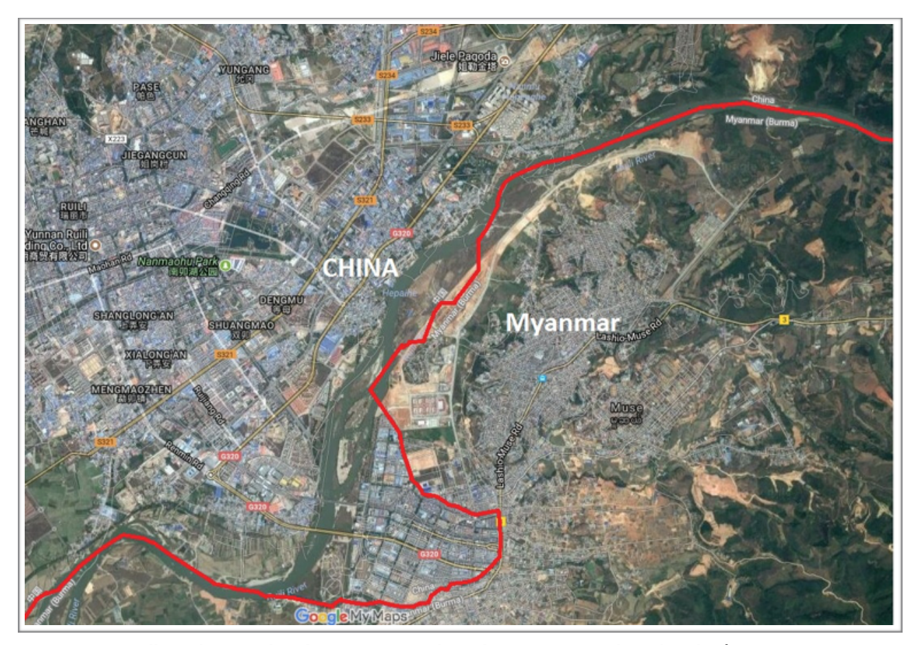
Picture 1: Satellite photo of border town of Ruili at the Myanmar-China border

Although the GMS initiative is only about five years older than BIMSTEC and the two share common focal areas (such as trade, energy, transport, tourism and environment), GMS projects have seen much more progress and involvement from all stakeholders. GMS has now been rolled into China's connectivity mammoth, the Belt and Road Initiative (BRI).